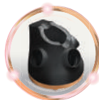
BASE / CHARGER